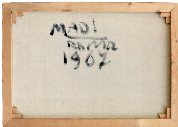
Hussein Madi, Untitled, 1967. Oil on canvas (reverse side). Collection of Mazen & Loulia Soueid.

The exhibition is placed under the patronage of the Italian Embassy in Lebanon, and is taking place in collaboration with Christie’s.