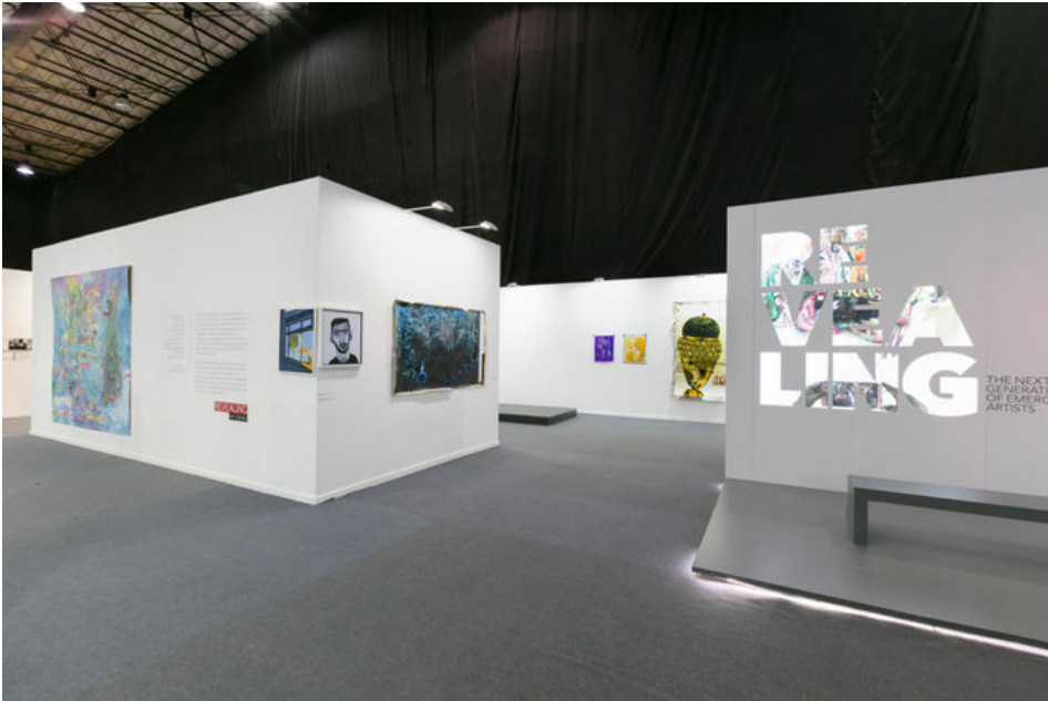
REVEALING by SGBL