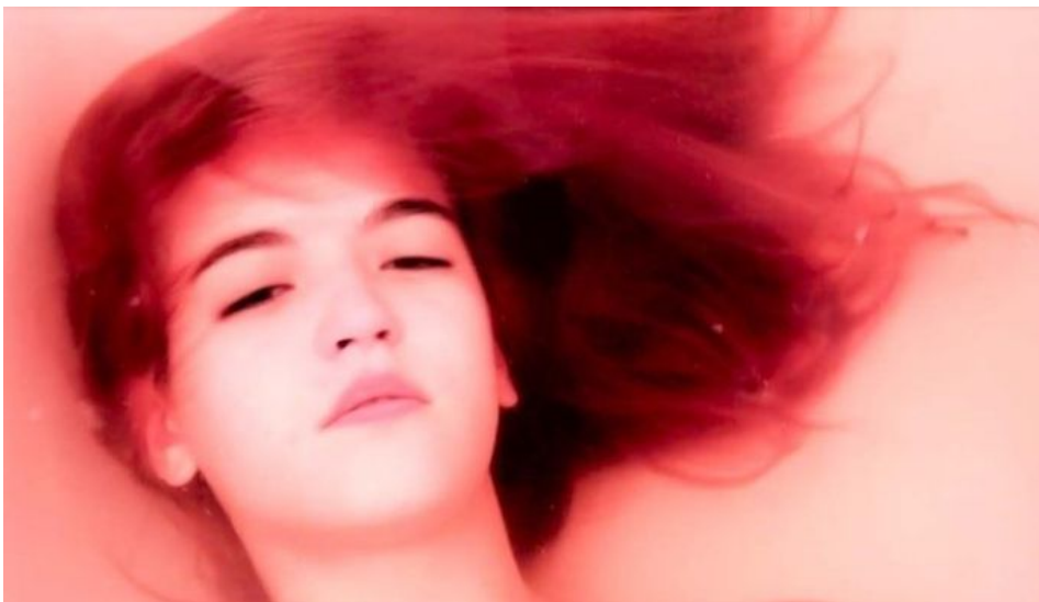
© Ange Leccia, Marissa, 2016. Video. Courtesy of the artist and galerie Jousse Entreprise, Paris.

'The Sensitive Sea' is a video program birthed out of a visual dialogue between Labanese and Western scenes around the theme of the sea. Present in both Western and Oriental lietrature, the showcase bridged both cultures across the Mediterranean, highlighting the sea as a contemporary artistic motif, as well as showcased the many ways to approach it.