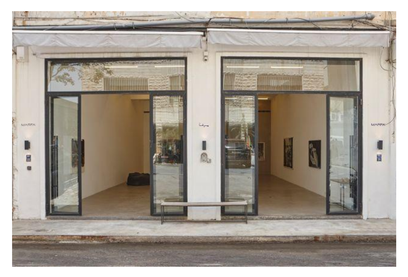
Marfa' Gallery.

The Beirut Art Center opened in 2009 as a non-profit organization to support regional artists and foster international cultural research. In addition to featuring rotating contemporary exhibitions, the center is also Beirut's first public space for art discussion, hosting a regular schedule of interactive workshops, lectures, screenings and performances. It's located in an emerging creative district on the banks of the Beirut River, just outside the city center.