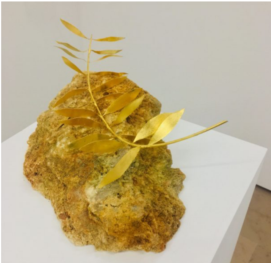
Camila Salame, 'Omen' – Memorial to a lost bird, 2019, olive tree branch, brass, gold leaf on limestone, unique piece 1AP, 14x31x15 cm on variable dimensions

Dates for the 11th edition of Beirut Art Fair are yet to be determined. Follow Beirut Art Fair on Instagram and Facebook to keep up with the ongoing artist highlight campaign running until December 9th.