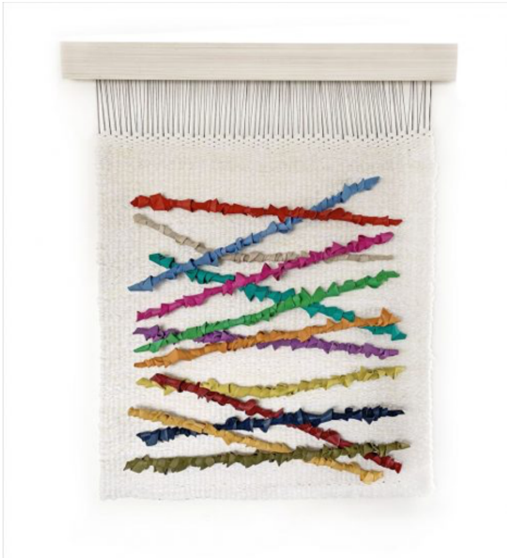
Michelle Maluf, Bright Side, 2019, Leather and yarn, Unique piece, 150×105 cm

Lastly, Camilia Salamé's sculpture installation is a memorial to the Bald Ibis, a bird whose species has now disappeared after being last seen in 2015 during the destruction of Palmyra. Considered as the sacred bird that brought the olive branch to Noah after the Flood, it is a figure of the rebirth but also of the loss of cultural and natural heritage. This poetic work is an allegory of the eternal link between man and the earth.